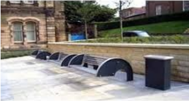
Furniture 1.5m long 3-seator curved bench with wood